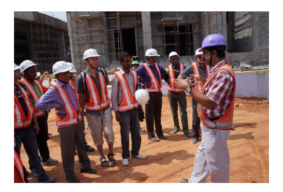
Module 4: Learning from Global experiences, Indian best practices and field examples of affordable housing projects.

This module will focus on evaluation of global experiences of affordable housing, case examples recognized as best practices in terms of affordability by detail case study and physical visits including interaction with the stakeholders. The module will include these concepts: