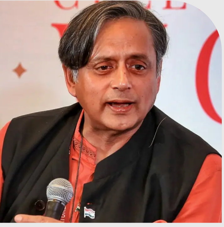
Dr. Shashi Tharoor Member Lok Sabha