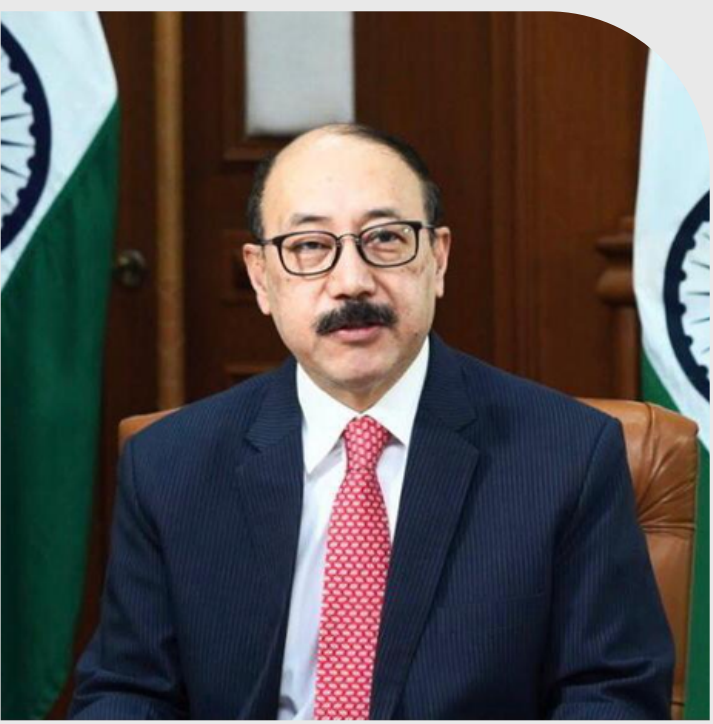
Shri Harshvardhan Shringla Chief Coordinator G20 Presidency 2023