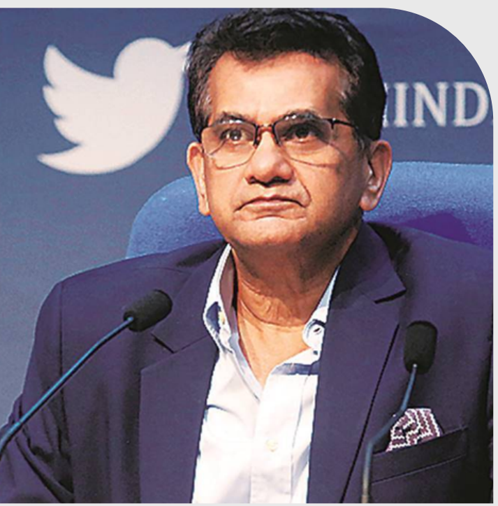
Shri Amitabh Kant Former CEO NITI AYO