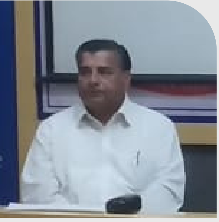
Dr TCA Raghavan, IFS Former High Commissioner of India to Pakistan