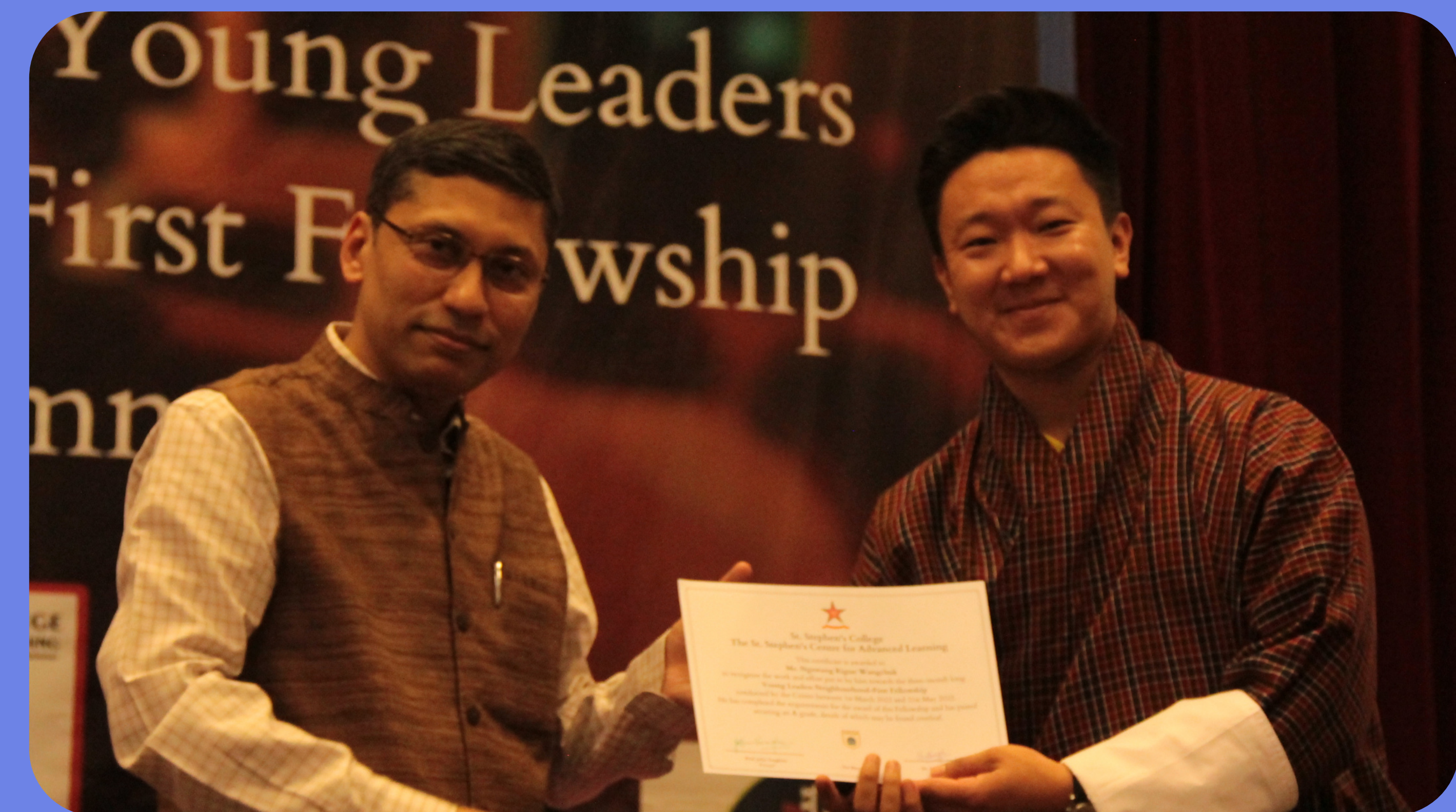
The St. Stephen's Young Leaders, Neighbourhood-First Fellowship Programme

You can check out more details about the St Stephen's Centre for Advanced Learning at https://www.ststephens.edu/scal